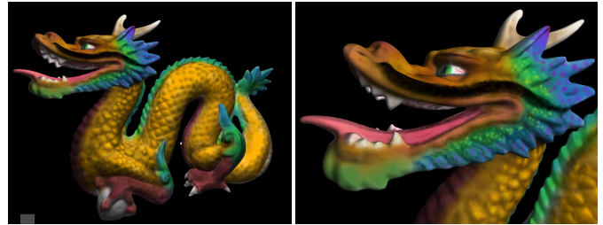
Figure 1: Our interactive 3D paint application stores paint in an octree-like structure with an effective resolution of 2048^3 (using 15 MB of GPU memory). Our system paints and renders this 817k polygon model with an octree texture at 15–20 fps and supports quadlinear filtering.

We unify memory usage for adaptive paint resolutions and mipmapping. The page table hierarchy allows us to share physical tiles between mip levels when the adaptive resolution is coarser than or equal to the mip level's resolution. This is non-trivial for two reasons. First, since we are using a "node-centered" scheme, as opposed to traditional "cell-centered" textures, the filter support is different (see Figure 2R). Second, since we are allocating texels in blocks, many texture samples do not intersect the surface and thus will never be assigned colors. It is important that these samples do not contribute to the filtering used for coarsening. Thus we identify "valid" texels by recording the resolution level at which each texel has been written into the alpha channel. This allows us to refine from low resolutions to higher resolutions while still identifying which samples were actually painted at a specific resolution.